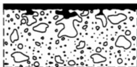
Figure 3 — Schematic drawing of a typical coating

NOTE 2 Binders may be, for example, organic polymers, organic polymers with cement as a filler or hydraulic cement modified with polymer dispersion.