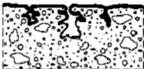
Figure 2 — Schematic drawing of a typical impregnation